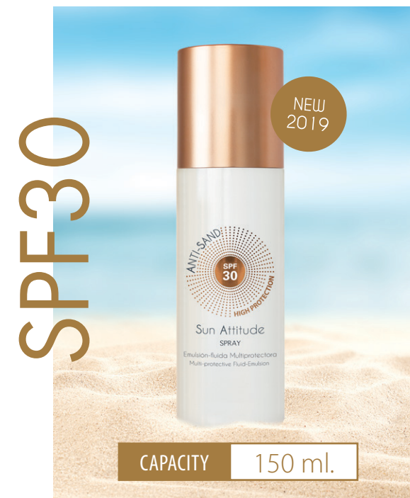
Multi-protective & Tan Booster Fluid-Emulsion ANTI-SAND

Spray solar care body treatment that combines state-of-the-art, broad-spectrum encapsulated sunscreens with tanning-boosting active ingredients that stimulate melanin synthesis and combat photo-aging for comprehensive and effective protection.