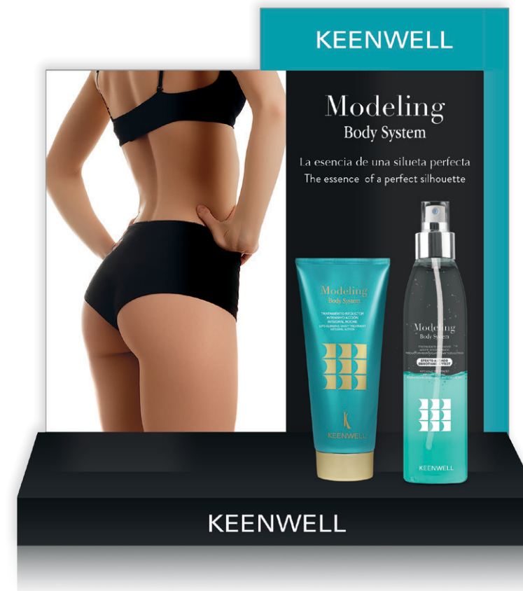
Modeling Body System Display Ref. K2043063

Modeling Body System is an exceptional collection of effective specially developed body treatments to rediscover the essence of a perfect silhouette.