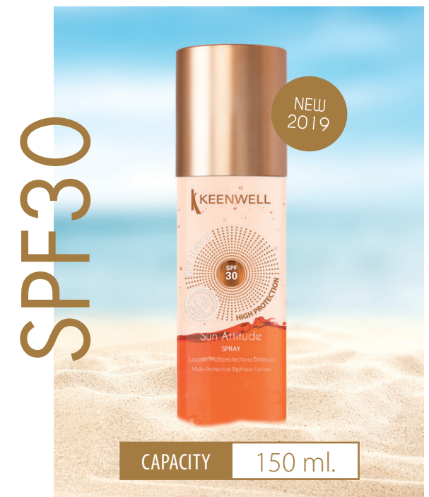
Multi-Protective Biphase Lotion Dry Touch

Spray solar care body treatment that combines state-of-the-art, broad-spectrum encapsulated sunscreens with tanning-boosting active ingredients that stimulate melanin synthesis and combat photo-aging for comprehensive and effective protection.