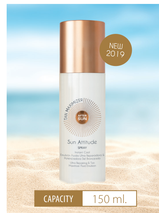
Instant Cool Ultra Repairing and Tan Maximizer Fluid Emulsion

Innovative photoprotector in biphase texture, with immediate absorption, invisible finish, and silky dry touch. Suitable for all skin types