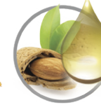
Sweet Almond Oil