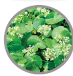
Centella Asiatica Extract